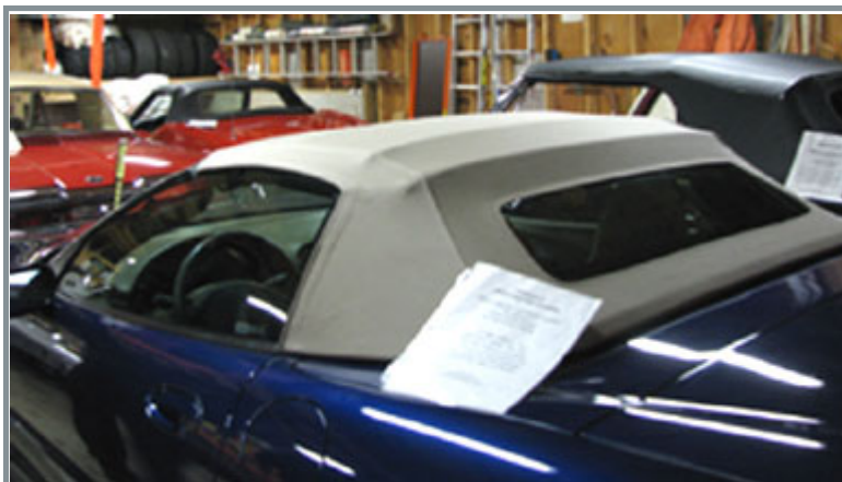
A partial view of Duncan and Dee's garage, where they carefully park and store their classic vehicles.

Dee bought her first-ever brand new car in 1999, a Mazda Miata, fondly named "Road Dancer" (check out her license plate). It's her daily drive and is decorated on the interior with silver leather seats, matching silver carpet and brushed aluminum trim. The silver fiberglass hardtop gets her through the winter and the black soft top comes out for summer driving. She calls it the perfect car because it's the