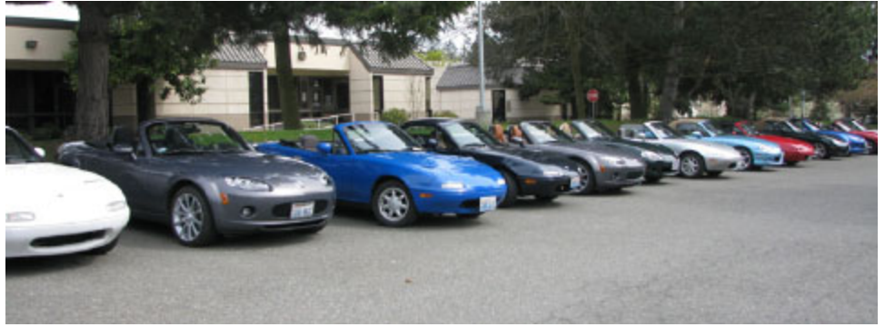
The parking lot at Azteca was full of Miatas with tops down for the New Members' Appreciation Drive April 19.