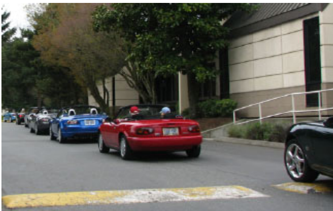
LEFT, 13 cars line up to take a short drive from Redmond to Issaquah, via Lake Sammamish, on the New Members' Appreciation Drive. Many board members and current members attended this lunch and drive and to get acquainted with new member (pictured above).