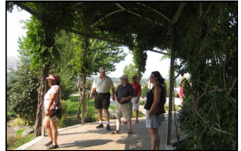
Terra Blanca provides nice shade

their beautiful accommodations, reminiscent of old eloquent California Spanish colonial architecture.