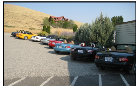
Miatas at Hightower

Kiona Vinyards and Hightower Cellars comprised our second and third stops for the day. These are great wines and again we basked in some fine hospitality which appears to be prevalent throughout the Red Mountain region.