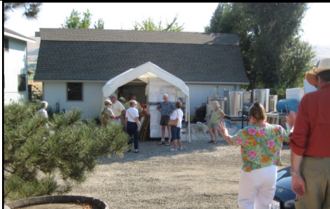
Sleeping Dog — a down home place!

Our next stop was the Sleeping Dog Winery near Benton. While we endured a tasting fee, we enjoyed some absolutely wonderful wines as well as the master vintner and his dog (hence, sleeping dog). As the pours became greater, we also enjoyed a run through his sprinklers with our collective bare feet as the group truly unwound.