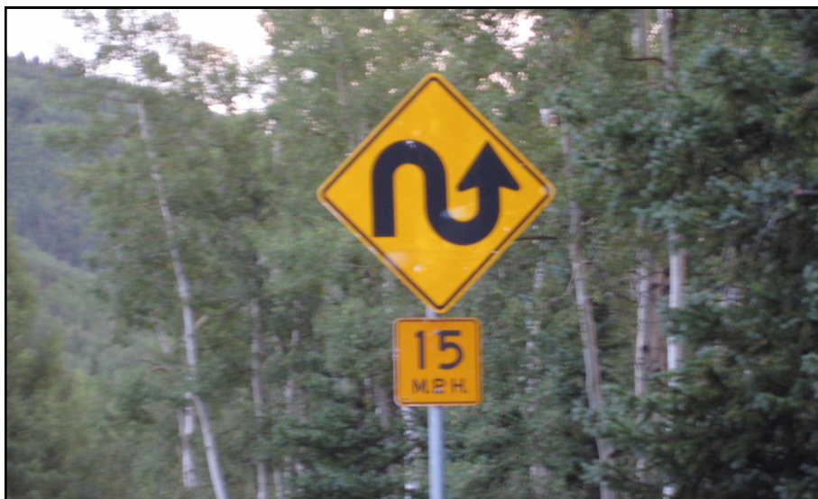
Highway 550 between Silverton Colorado and Ouray Colorado

Note: Watch the PSMC website for the latest and sometimes changing information