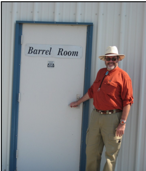
"Ginkgo Forest Wine? Found it!"

Our first winery stop was Ginkgo Forest. This stop afforded our group with some great wine tasting, a great hamburger lunch including wine and some marvelous fresh-picked fruit. The visit was memorable and the hospitality of our hosts was beyond reproach.