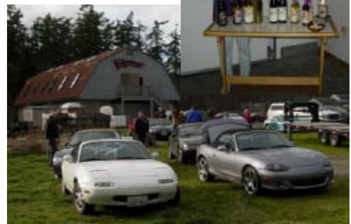
From top to bottom: arriving at Eleven for a 9:30 AM tasting; our wonderful (inebriated? on wine? on the day?) host at Bainbridge Winery; only one more stop after Fair Winds!