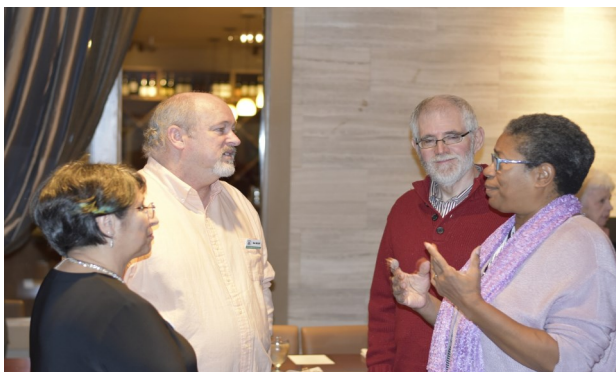
A President's Award was presented

tizers and four main course items that included salmon. After dinner, a special Thank You was given by the President to the Board and members, and awards were given to this year's Event Hosts.